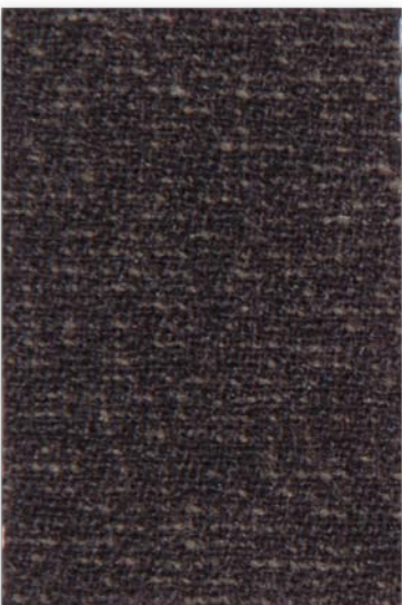
Night WK 012