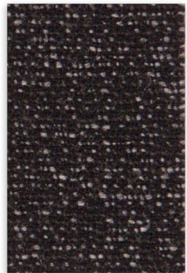
Century WK 025