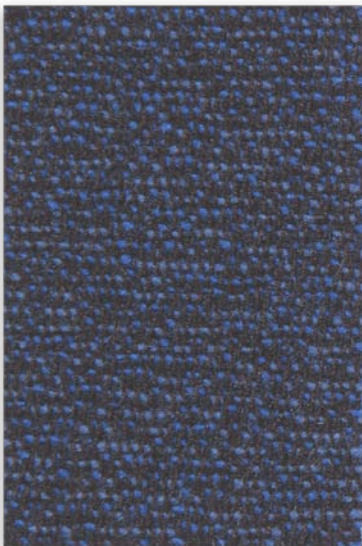
Continual WK 004