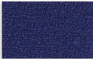
Epoch WK 022