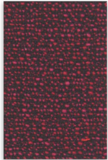
Sundown WK 010