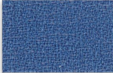
Ticking WK 014