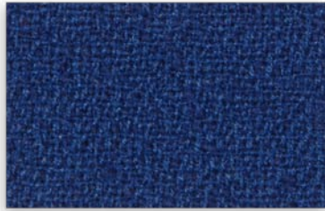
Perpetual WK 013