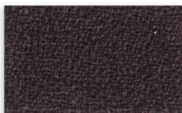
Forever WK 017