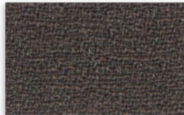
Nadir WK 021