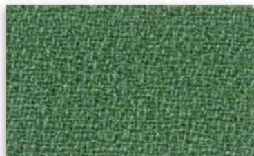
Season WK 024