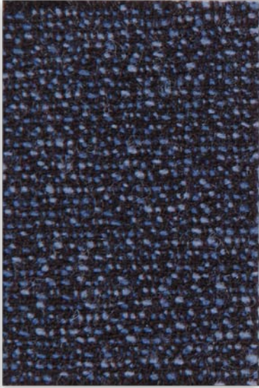
Day WK 003