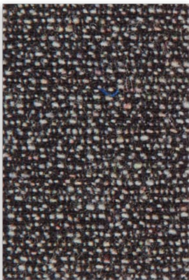
Zenith WK 002