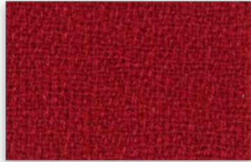
Timeless WK 016