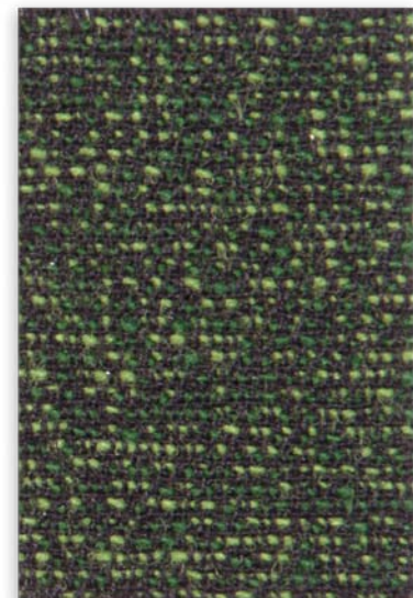
Duration WK 007