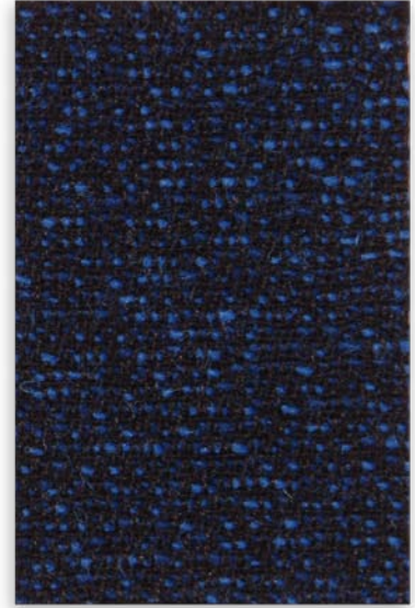
Hour WK 001