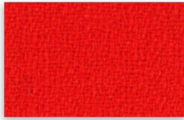
Solstice WK 018