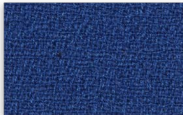
Pendulum WK 023