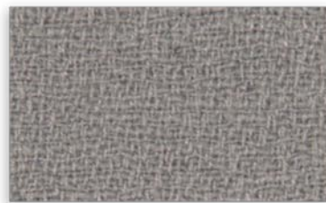
Decade WK 020